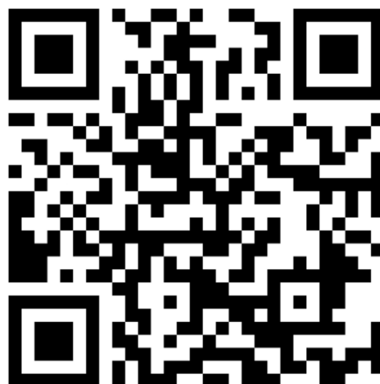
Further reading: https://taler.net/en/news/2024-08.html